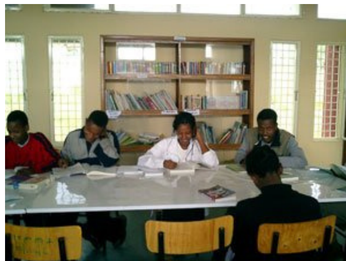
The library after H2 Empower donated books.