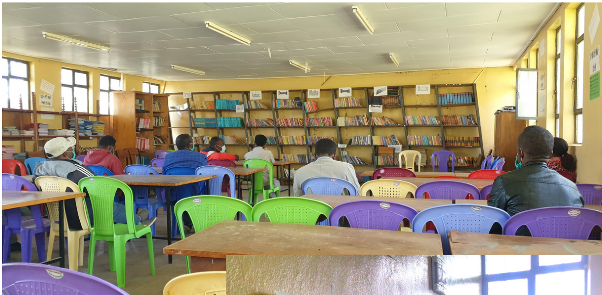
Teachers learning a new Girls Empowerment Curriculum.

This school served 400 families in 2017 and in 2023 serves 5,000 families. The school is located near the weekly marketplace, with families with very little means. We brought clean water to the campus, and they extended it to the Kindergarten class. The neighborhood also received access to water and asphalt roads to improve the infrastructure. H2 Empower built four kindergarten classrooms for 400 children. (They have 2 sessions each day in one classroom). The younger children are now able to begin to learn readiness skills to be successful in school. This school also has many special needs students who benefit from these advancements. In addition, H2 Empower donated many books to their library and facilitated girl's empowerment training there.