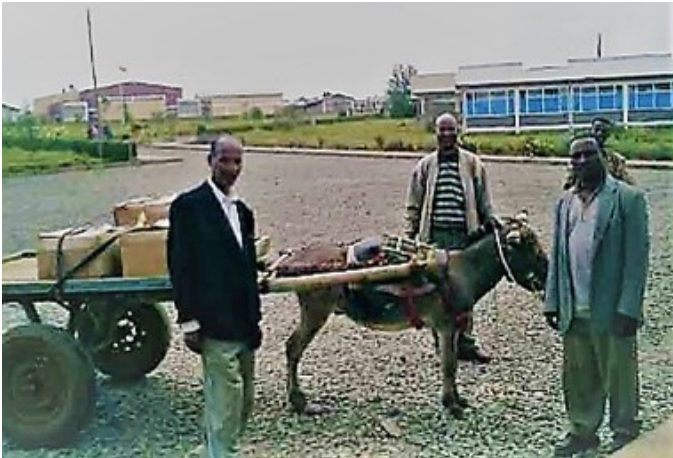
This photo shows the teachers getting the books to go to the school from the teacher's college.

This school is in the highest point of the town and extremely remote. We were able to bring water up the mountain to this school and local communities with challenging engineering. Then there were many water points installed on the way for the residential community there. In addition, once the water was installed, another NGO, Roots Ethiopia , put in modern toilets for the school, an example of the power of collaboration. We also donated books to this school library and used it for teacher and librarians training.