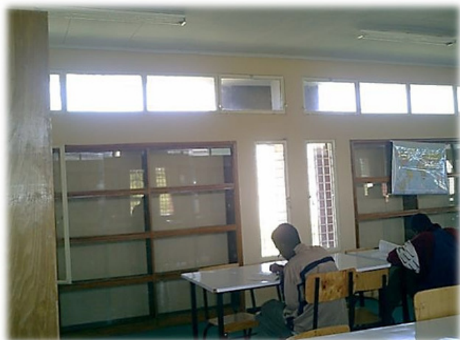
The library before H2 Empower.