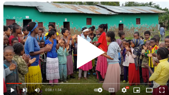
This is a video of the children showing their appreciation for us bringing water to this community.

H2 Empower supplied books to the school's small library and created classroom reading corners. In addition, H2 Empower provided soccer balls for the kindergarten children to enjoy.